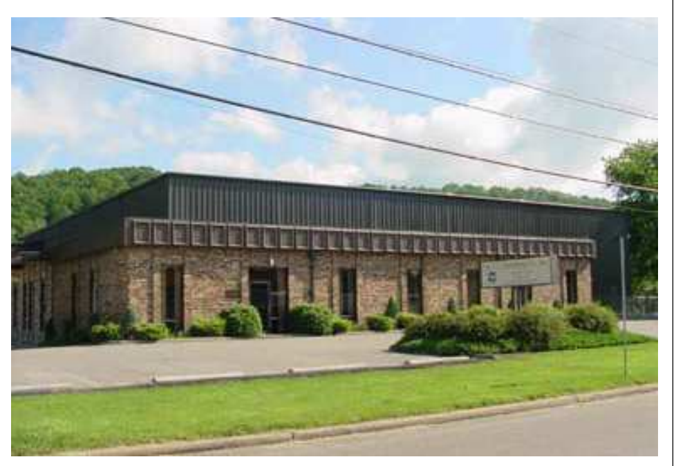
C.I. Thornburg Company is the most complete water and wastewater supply distributor in the region. They serve as the statewide vendor for water treatment chemicals (WATERT03A), offering an extensive line of products to the state.

With corporate headquarters in Huntington and a branch in Bridgeport, West Virginia, C.I. Thornburg