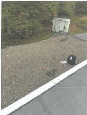
Project: 95778 Date: 9/26/2024, 10:39am Creator: Brad Burns