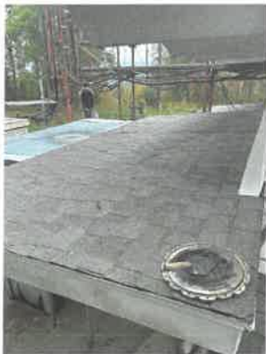
Project: 95778 Date: 9/26/2024, 10:27am Creator: Brad Burns