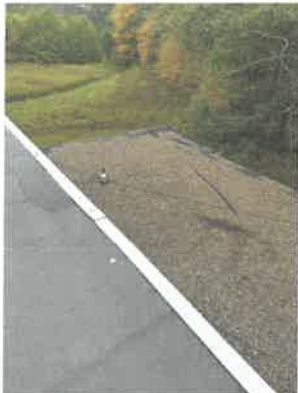
Project: 95778 Date: 9/26/2024, 10:39am Creator: Brad Burns