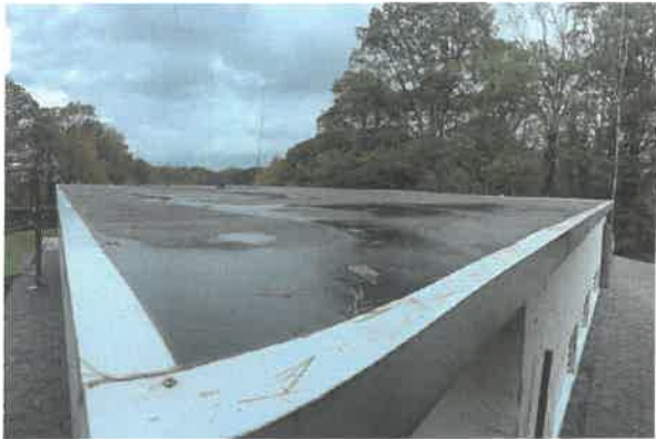
Project: 95778 Date: 9/26/2024, 10:27am Creator: Brad Burns