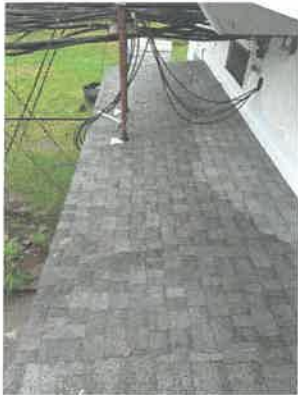
Project: 95778 Date: 9/26/2024, 10:28am Creator: Brad Burns