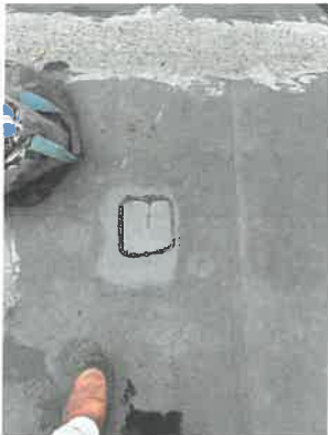
Project: 95778 Date: 9/26/2024, 10:39am Creator: Brad Burns