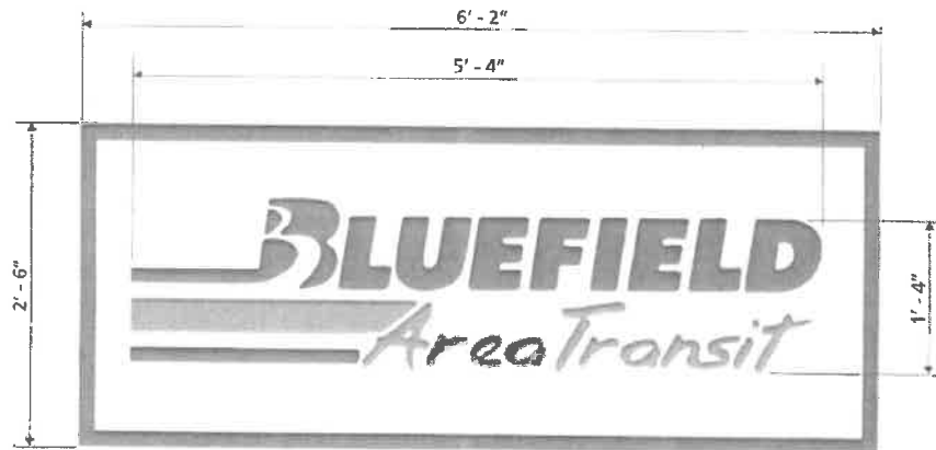
Front View Detail Scale: Not To Scale