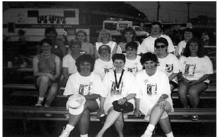
Pictured above are some of the "Along Came Mary" team members from the West Virginia Health Care Authority. The Authority's team raised a team total of $5,193 and placed 3 rd among the 64 teams in total team fundraising.