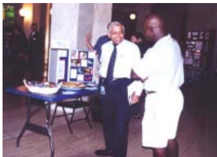
Top and bottom: State employees enjoy the offerings from the State Employees Combined Campaign kick-off.