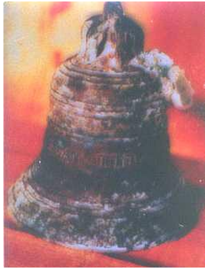
The bell was the key to unraveling the mystery of the Henrietta Marie .

The highly interactive display is comprised of artifacts and objects recovered from the English merchant slave ship. Highlights from collection are shown in an innovative exhibit format appealing to visitors of all ages. Visitors explore the early history of the transatlantic slave trade and the shared impact of the trade on the material life and culture of the peoples of Europe, West Africa, and the New World. The displays recreate the route of the slave trade, transporting visitors from a London port (circa 1698) to West Africa, and finally to a sugar plantation in the West Indies. The interactive ele-