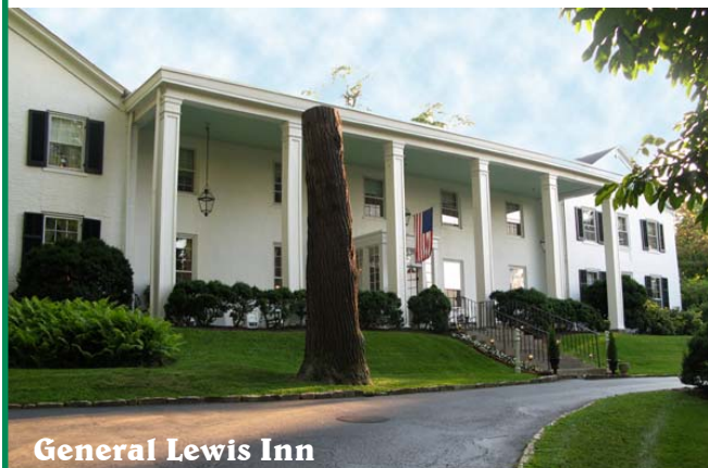
General Lewis Inn

On your way to Ronceverte, you'll want to allow time to head into nearby Lewisburg. Perhaps you'll make a night (or an overnight) of it and have dinner and/or stay at the historic Civil War era General Lewis Inn and Restaurant.