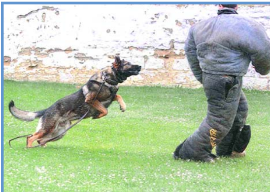
Above and below: Mock Prison Riot participants practice a variety of skills and techniques, including working with canines and scenarios dealing with maintaining and restoring order.