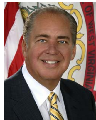
Governor Earl Ray Tomblin

While speaking on the State's budget, the Governor acknowledged that the hardships born from the worldwide recession were both real and long-lasting. He further acknowledged that difficult choices made over the past few years allowed West Virginia to come through those hard times in better shape than most other states in the country. With that, he presented a budget that was not only balanced, but contained no new fees, no teacher or gov-