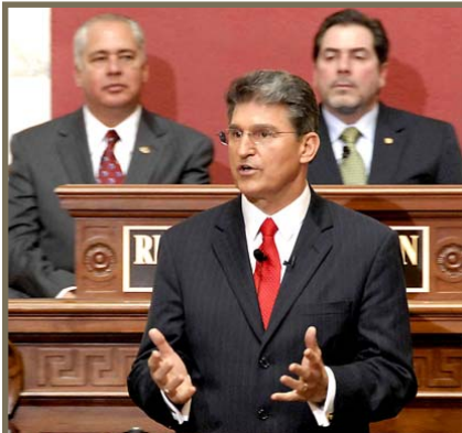
Governor Joe Manchin delivers his 2009 State of the State Address on February 11, 2009.

Presenting his first State of the State Address since being re-elected, Governor Joe Manchin III began his February 11, 2009 speech by saying he was both honored and humbled by the faith placed in him and his administration.