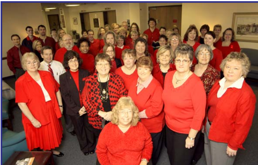
February 6, 2009 was a red-letter day for citizens across America as people wore red-colored clothing for National Wear Red Day. This annual event is sponsored by the American Heart Association to support the fight against the #1 killer of women today – heart disease. Above, employees of the West Virginia Division of Rehabilitation Services – men and women – show their support for the cause.

While discussing the sadness of recent layoffs, and plant and business closures, he reminded us that because of our State’s positive economic condition, we aren’t facing