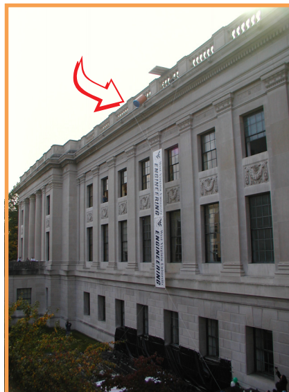
An entry from a previous year makes its way over the top. The pumpkin didn't survive.

For rules and details, visit www.educationalliance.org/Downloads/PumpkinDrop/PumpkinDrop2007.pdf or call The Education Alliance at 342-0046.