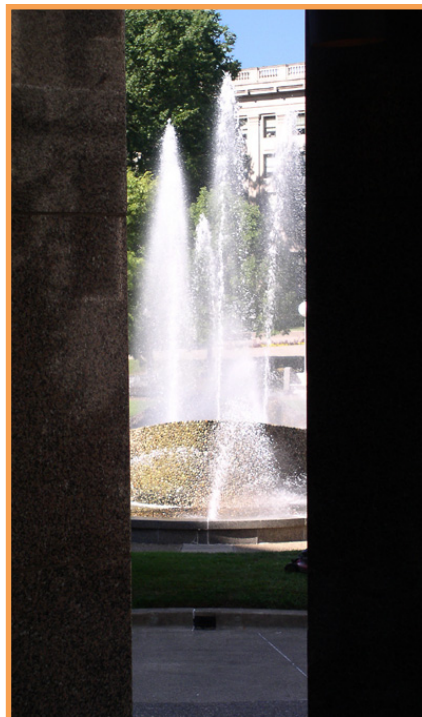
The oval fountain at the State Capitol refreshes a gorgeous September day. This view is through the pillars of Building 7.

For help to quit tobacco use, contact your health care provider or call the West Virginia Tobacco Cessation Quitline toll-free at 1-877-966-8784. For more about the West Virginia Division of Tobacco Prevention and its programs, call 558-2939 or visit www.wvntp.org on the web.