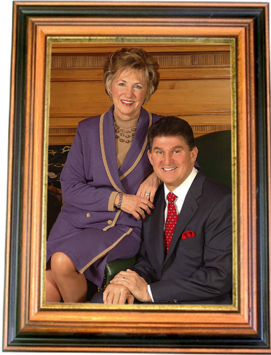
Governor Joe Manchin III and First Lady Gayle C. Manchin

The holiday season is here! This time of year holds a special meaning for everybody. For Gayle and me, the holidays mean spending time with our families, sharing the joy of the season with others, and being thankful for our many blessings. We are truly fortunate to be able to celebrate with our immediate family, and with our extended family – the people of the Mountain State.