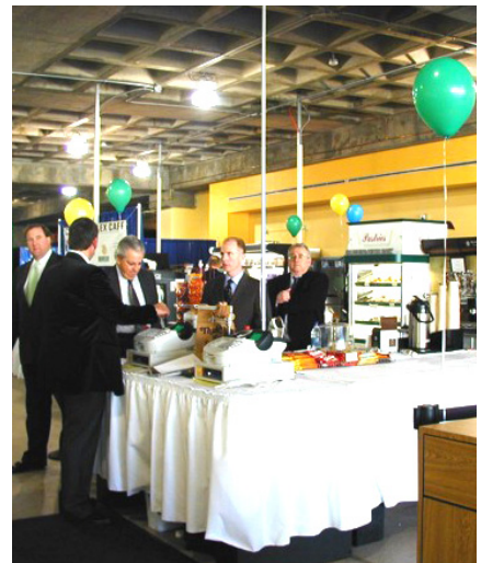
Employees and visitors enjoy the offerings at the Capitol's Temporary Cafeteria.

Since January 8, 2007, the temporary cafeteria has been providing State employees, lobbyists, and legislators with a variety of offerings, including soups, salads, and various entrees such as baked lasagna, roast chicken, steamed vegetables, and Salisbury steak. Also, customers seeking sensible foods for a healthier lifestyle can enjoy the dining option of a "Balanced Choice" menu.