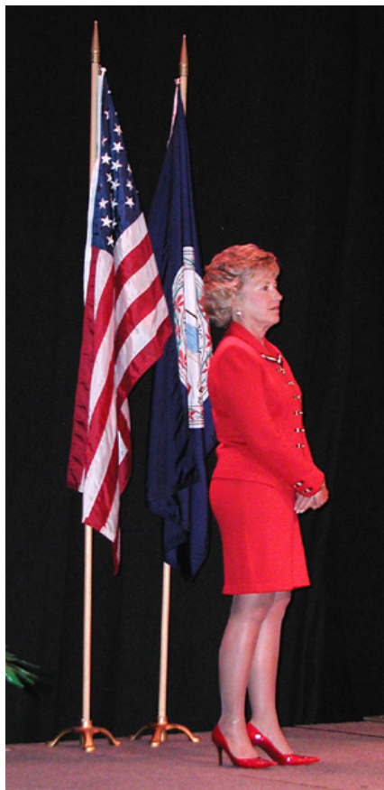
West Virginia First Lady Gayle C. Manchin