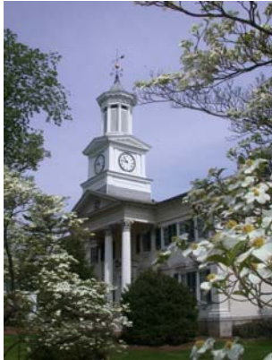
Shepherd University's McMurrin Hall.

The book profiles 150 colleges with excellent academics, generous financial aid packages, and relatively low costs. Named to the list were 103 public and 47 private colleges in 40 states. The Princeton Review chose the colleges for the book based on data the company obtained from administrators at 646 colleges and its surveys of students attending them.