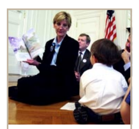
First Lady Sandra Wise reads to a group of students at the kickoff of Read To Me! Day 2001.

By sharing the joy of reading aloud, volunteer readers model posi-