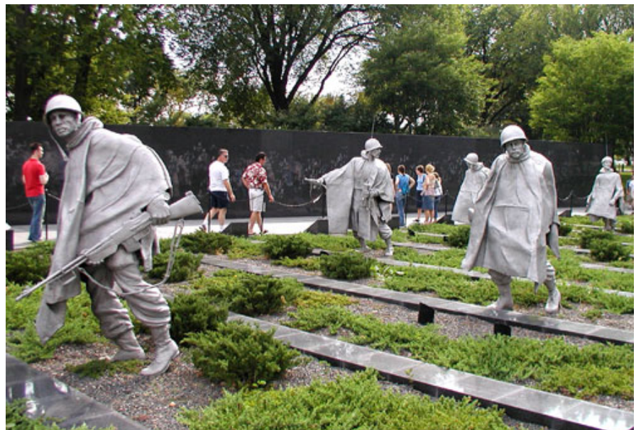
Faces on the soldiers of the Korean War Memorial in Washington, D.C. show the strain of war. The Korean War was one of the most hard-fought in our history. The memorial honors all 5.8 million Americans who served, including the 103,248 who were wounded and 54,246 who died.

Veterans Day is largely intended to thank living veterans for their service, to acknowledge that their con-