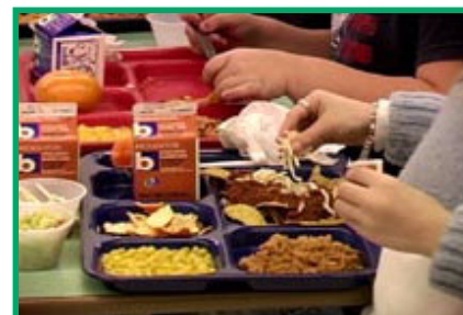
School children are benefitting from WVDA-supplied foods.

For more information, visit www.wvagriculture.org .