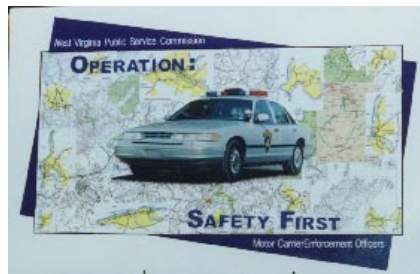
The Public Service Commission's "Operation: Safety First" Campaign is geared to step up safety enforcement on major roads and highways in West Virginia.