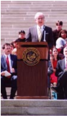
LEFT: Governor Cecil H. Underwood was on hand the morning of May 1 to provide the Opening Ceremony Keynote Address.