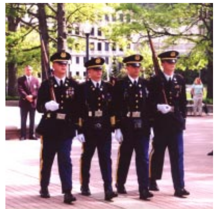
All shined and polished, the Color Guard, comprised of Capitol High JRTOC students, prepares to retrieve the colors at the Opening Ceremony.

They were treated to coffee, donuts, and flowers for the ladies.