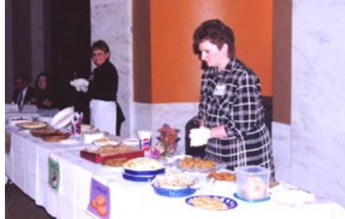
First we lined 'em up and displayed 'em ...