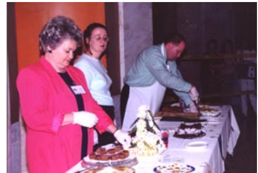
... and then we cut 'em up and served 'em.