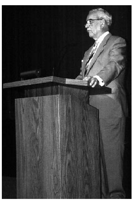
File photo: Governor Cecil H. Underwood

This year's conference features an expanded list of workshops and vendor participants. Watch for additional information in future issues of Stateline .