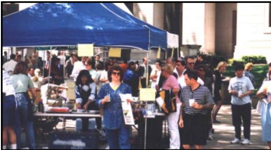
State employees enjoying the weather and food booths at the 1998 Public Service Recognition Week activities in Charleston.

Public Service Recognition Week is set aside to honor public employees across the country. This year, it is planned for the first week of May. The Opening Ceremony will be Monday, May 3 at 11:30. The Governor’s Ceremony is Tuesday, May 4 at 1:30. Other activities including a goodies bake off and live music are scheduled throughout the week.