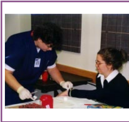
A health fair participant undergoes one of the many health screenings offered at the DOT/DOH 11th Annual Health Fair.

The DOT/DOH Wellness Program wishes to thank the following doctors and other health care professionals who took time away from their extremely busy schedules to participate in this year's Fair: