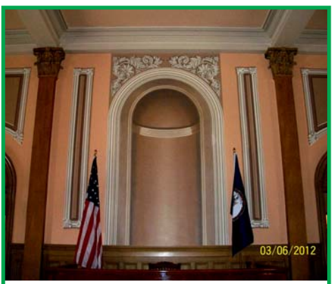
Independence Hall Courtroom – the wall behind the judge's desk.

West Virginia Independence Hall was originally built to serve as a federal custom house in 1859. It was home to pro-Union state conventions of Virginia during the spring and summer of 1861 and served as the capitol of loyal Virginia from June 1861 to June 1863. It is also the site of the first constitutional conven-