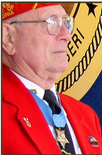
Woody Williams stands proudly at the ground-breaking ceremony for the Veteran’s Nursing Home in Clarksburg, WV. The ceremony took place in October, 2003.