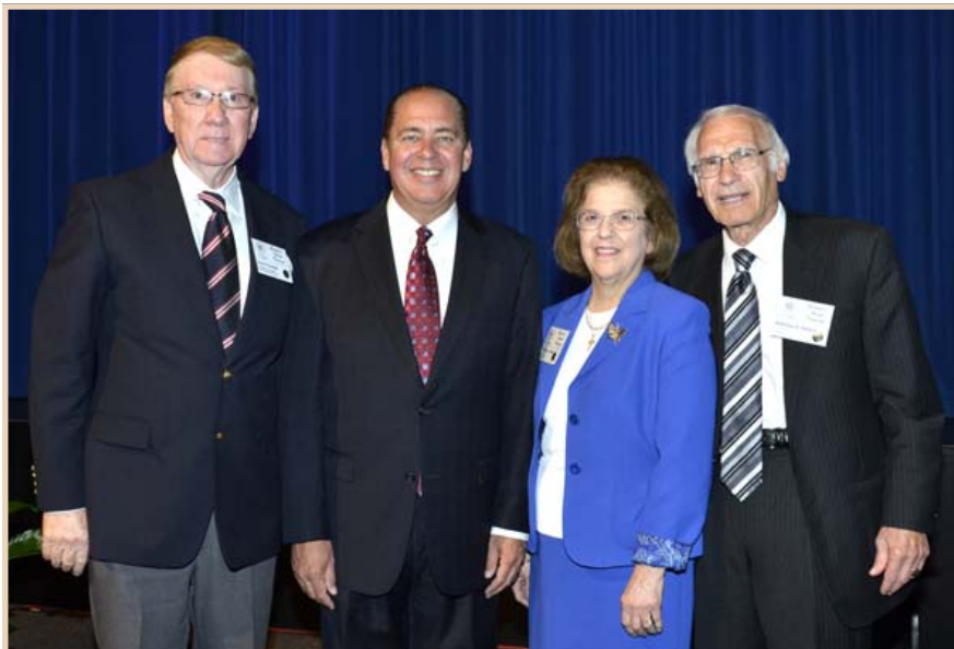
West Virginia state employees with more than 50 years of service receive recognition for their ongoing dedication from Governor Tomblin.

Our state's celebration of PSRW started in 1992, and Governor Earl Ray Tomblin continued the tradition this year. West Virginia employees who attained the milestones of 20, 25, 30, 35, or more years of service received