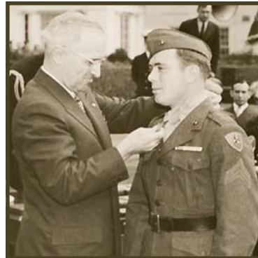
Corporal Hershel Woodrow Williams receives the Congressional Medal of Honor from President Harry S. Truman on October 5, 1945.

enemy positions one by one. He stopped only to grab fresh weapons or return to his own lines for them. Fi-