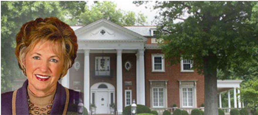
West Virginia First Lady Gayle C. Manchin urges all citizens to complete their census forms.

Reprinted (with edits) from the First Lady's Desk: A Monthly Message by First Lady Gayle C. Manchin.