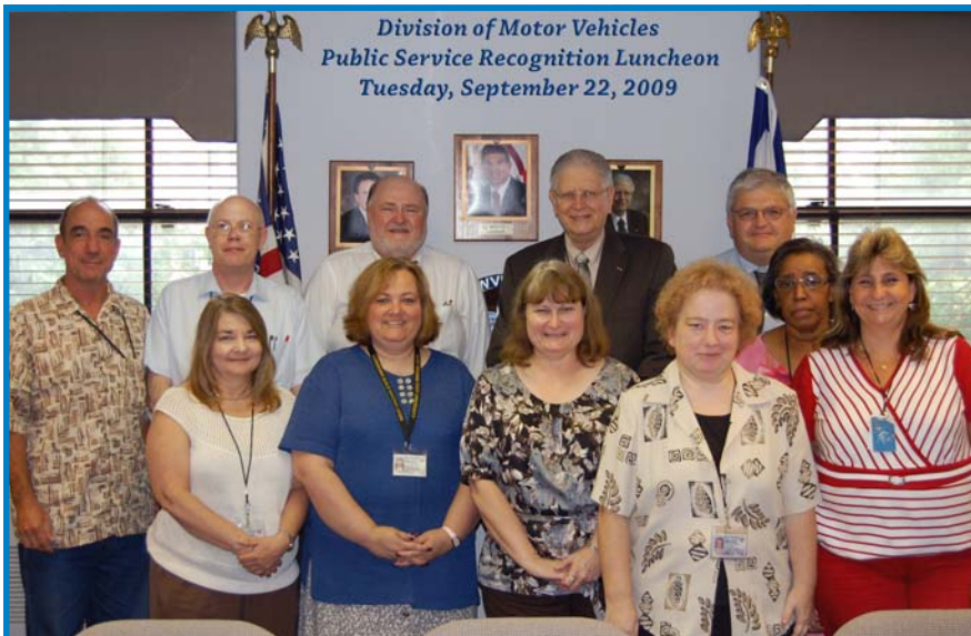
The Division of Motor (DMV) Vehicles celebrated Public Service Recognition Week 2009 with a luncheon for its employees who had reached 20, 25, 30, 35, and 40 years of service. At the conclusion of the luncheon, all Charleston vicinity DMV employees were invited to a dessert reception. Regional offices held local celebration activities.

This virus was originally referred to as "swine flu" because laboratory testing showed that many of the genes in this new virus were very similar to influenza viruses that normally occur in pigs (swine) in North America. But further study has shown that this new virus is very different from what normally circulates in North American pigs. It has two genes from flu