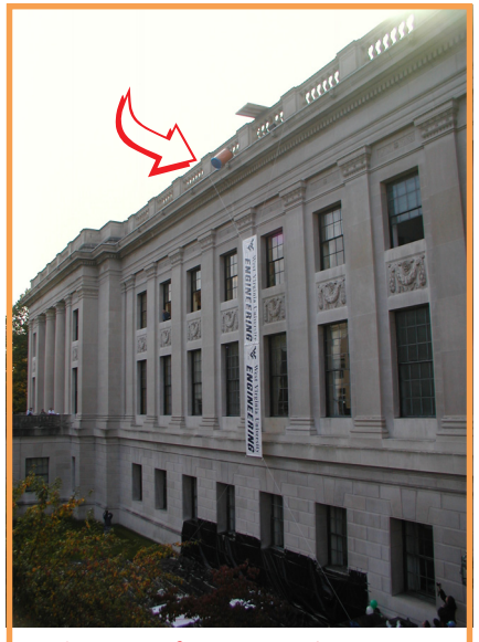
An entry from a previous year makes its way over the top. The pumpkin didn't survive.

For rules and details, visit www.educationalliance.org/ Downloads/PumpkinDrop/ PumpkinDrop2007.pdf or call The Education Alliance at 342-0046.