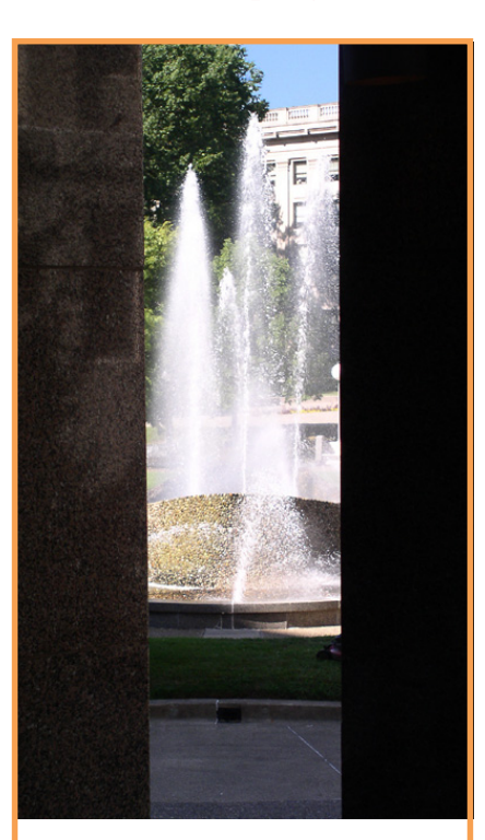
The oval fountain at the State Capitol refreshes a gorgeous September day. This view is through the pillars of Building 7.

For help to quit tobacco use, contact your health care provider or call the West Virginia Tobacco Cessation Quitline toll-free at 1-877-966-8784. For more about the West Virginia Division of Tobacco Prevention and its programs, call 558-2939 or visit www.wvdtp.org on the web.