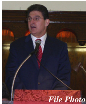
Gov. Joe Manchin III

Most of the revenue enhancements included in this Special Session plan are based upon making sure out-of-State residents who work or profit in West Virginia pay their fair share, eliminating several outdated loopholes or tax credits that are part of our overall tax modernization efforts, and taxing non-healthy food items such as candy, pop, and chips at six percent.