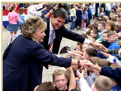
Governor and Mrs. Manchin greet guests at the unveiling ceremony.