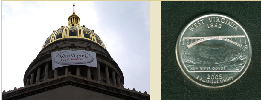
UNVEILED: Both long-awaited, the regilded Capitol Dome (left) and the West Virginia state quarter (right) were unveiled on October 14, 2005.