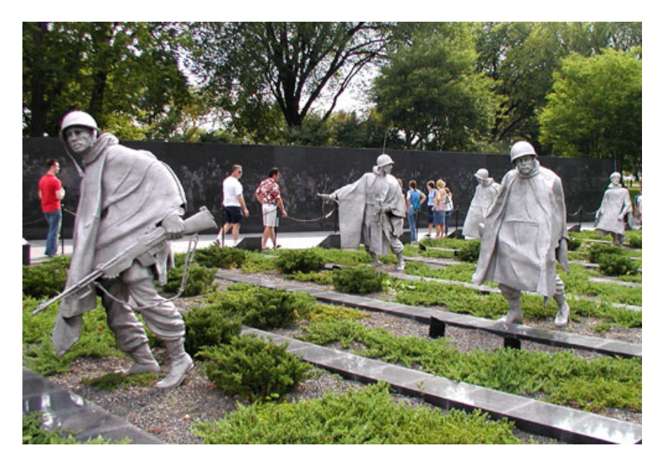
Faces on the soldiers of the Korean War Memorial in Washington, D.C. show the strain of war. The Korean War was one of the most hard-fought in our history. The memorial honors all 5.8 million Americans who served, including the 103,248 who were wounded and 54,246 who died.