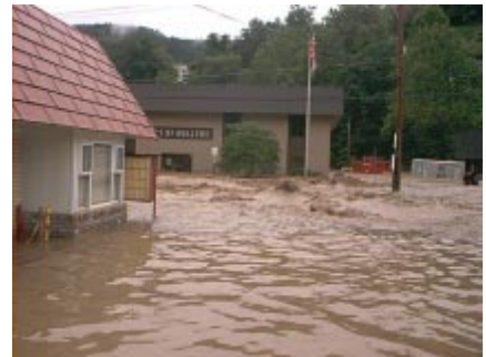
Flood waters raged through Mullens, WV on July 8, 2001, washing away homes, businesses, and even the U.S. Post Office. The entire town was devastated.

The scope of DEP's involvement was far-ranging and included Environmental Enforcement inspecting and helping sewage treatment plants get back online and operational. The Division of Waste Management, in conjunction with the Environmental Protection Agency, identified hazardous materials problems, such as tanks and drums being washed down streams and rivers.