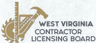
Chair, West Virginia Contractor Licensing Board

A copy of this license must be readily available for inspection by the Board on every job site where contracting work is being performed. This license number must appear in all advertisements, on all bid submissions, and on all fully executed and binding contracts. This license is non-transferable. This license is being issued under the provisions of West Virginia Code, Chapter 30, Article 42.