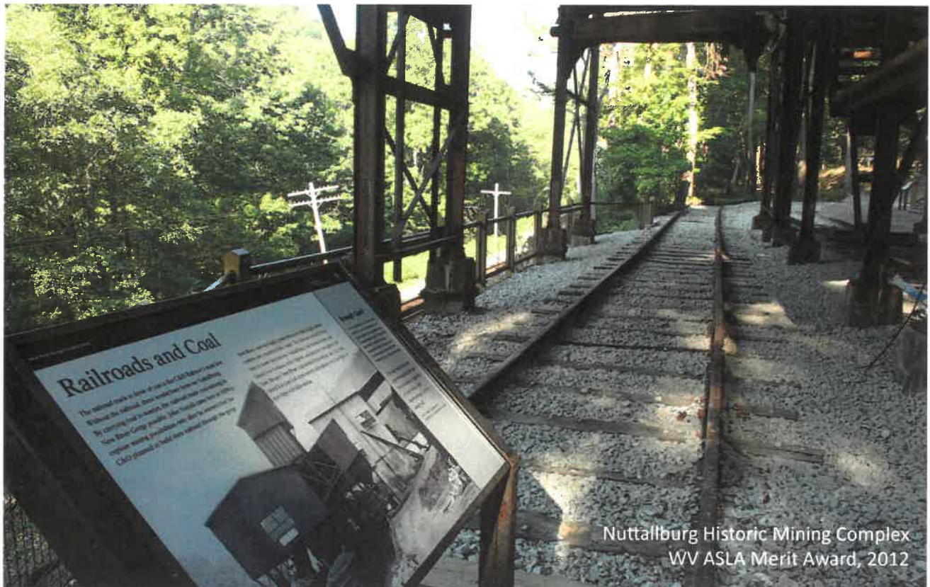
Nuttallburg Historic Mining Complex WV ASLA Merit Award, 2012