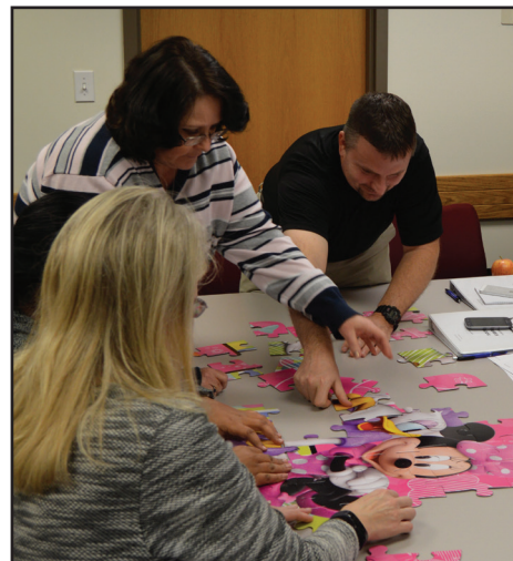
Attendees work together during a Developing Specifications workshop to assemble a puzzle and then write specifications for the missing piece.

The Purchasing Division continues to implement such activities and has been pleased with the positive response re-