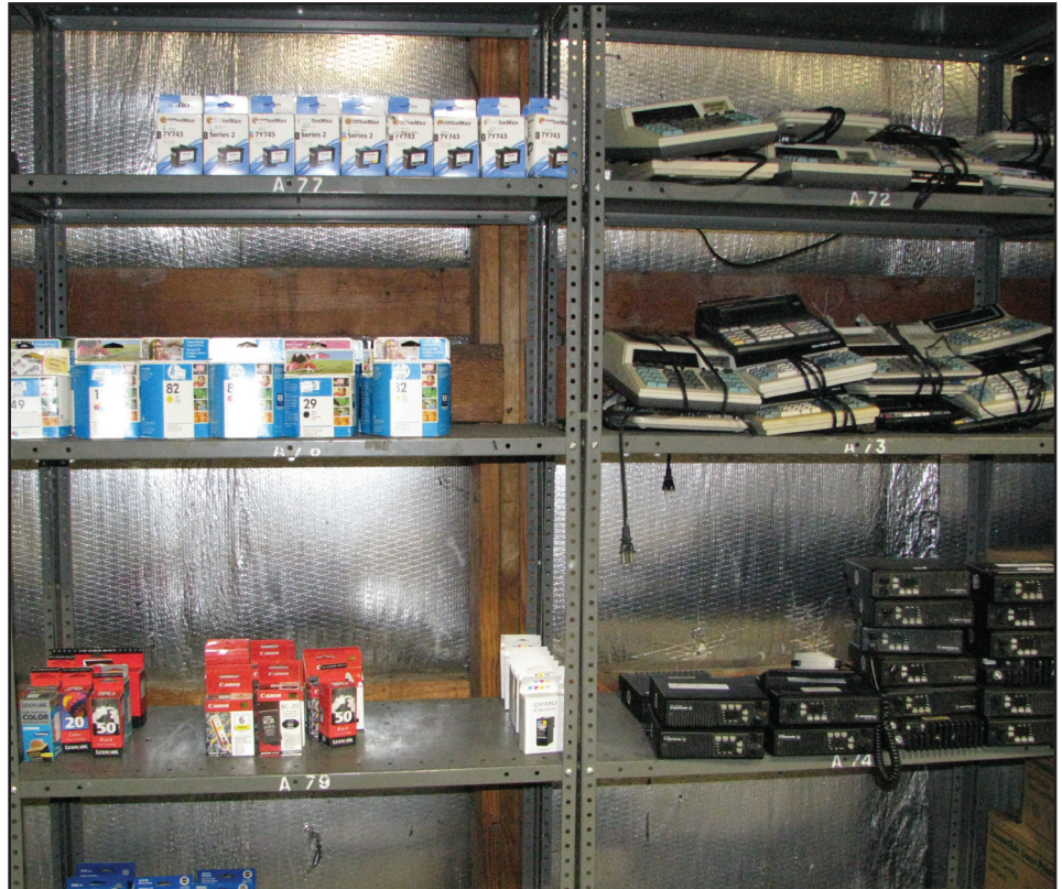
New shelving installed in the warehouse at the West Virginia State Agency for Surplus Property means a clearer display of items that are available for sale.

Perdue said the goal of the work is to make the shopping experience at WVSASP friendlier and easier. “We want to best utilize this space and make it more convenient for when state agencies or daily sales' customers who come to the warehouses to browse, or to find