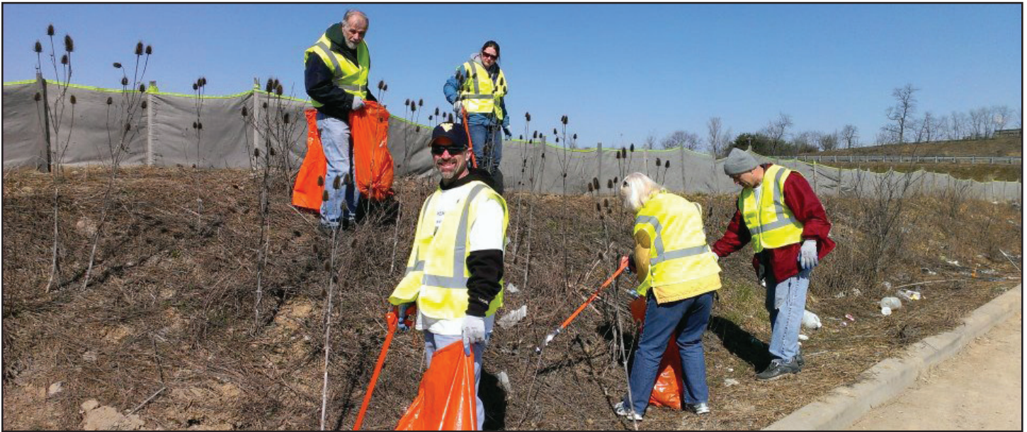
Adopt-A-Highway volunteers pick up trash along a West Virginia road while wearing a safety vest procured through the Purchasing Division for the Division of Highways.

This created a need for us to improve our specifications to meet higher standards while at the same time find the best possible price through the procurement process.”