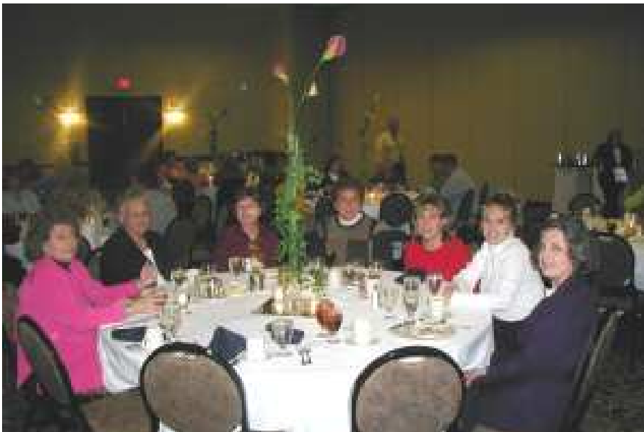
Group meals were a productive way to network with other agency purchasers throughout the conference.