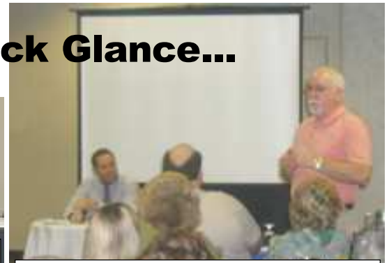
During the "Problems and Solutions" class, an open forum included a variety of issues from the audience.