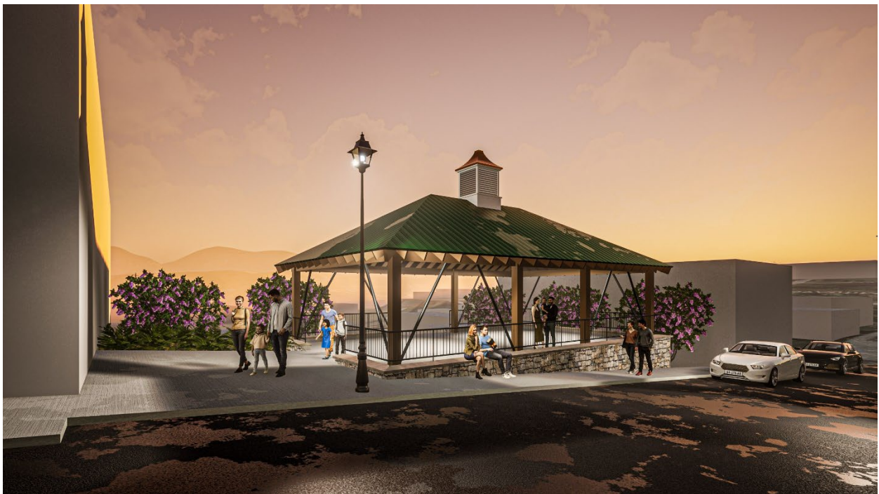
Historic Russell Theater Park Pavilion | Town of Lebanon, Virginia