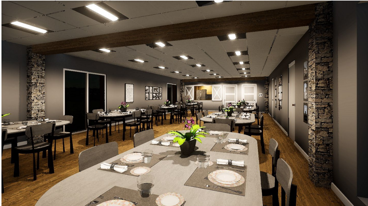
Samson Event Center | Grundy, Virginia