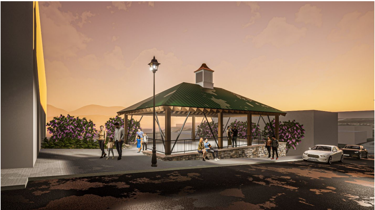
Historic Russell Theater Park Pavilion | Town of Lebanon, Virginia