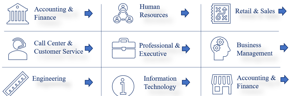
Figure - Our Staffing Services Domains

Nasscomm's full spectrum of staffing and support programs includes recruitment, job screening, evaluations, reference checks, background and drug investigation, education verification, and DMV searches. Nasscomm can coordinate and manage all sub-vendor relationships nationally or globally, through centralized management and world-class networked systems. Nasscomm's proprietary technological tools reduce paperwork, increase efficiency, and ensure quality. We create and manage process improvements that result in a streamlined, cost-effective, and user-friendly process for managing temporary employees and staffing vendors.