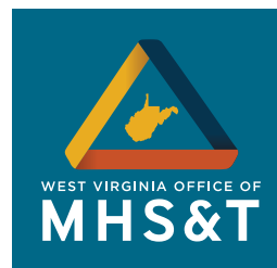
FULL COLOR REVERSE NO BAR