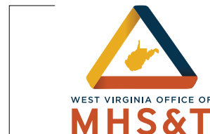
MINIMUM SIZE LOGO NO BAR