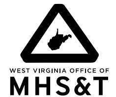
BLACK NO BAR