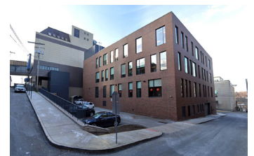
Butler County Government Center Annex Addition Butler, PA

Ohio District of Columbia Florida Illinois Indiana Kentucky Maryland Michigan New Jersey New York North Carolina Missouri Virginia West Virginia Texas