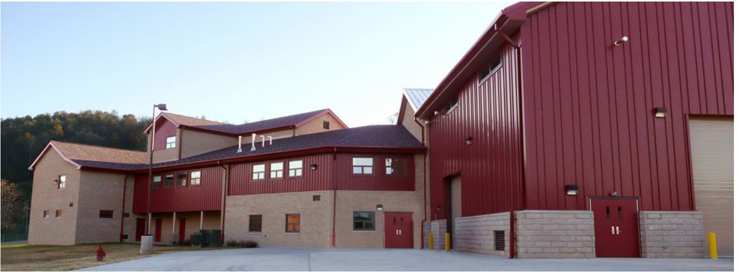
| continued State Fire Training Academy |

The second component, the 8,300 SF open bay training Arena, is an all-weather interior training facility. The scale of this structure, having a clear interior height greater than 30', allows the full extension of authentic fire training apparatus and vehicles for various types of hands-on programs. The large vehicle doors allow fire trucks and other props into the facility. A custom metal building skeleton with a board & batten metal skin was designed. The siding is representative of rural, vertical barn siding and serves as an integrating element throughout the large complex.