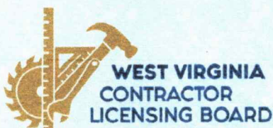
Chair, West Virginia Contractor Licensing Board

A copy of this license must be readily available for inspection by the Board on every job site where contracting work is being performed. This license number must appear in all advertisements, on all bid submissions, and on all fully executed and binding contracts. This license is non-transferable. This license is being issued under the provisions of West Virginia Code, Chapter 30, Article 42.