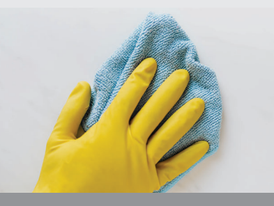
Easy Clean Surfaces

Control lighting, operate awnings and monitor cameras remotely with the use of an iPad.